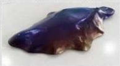
UNDERSIDE OF BOWL

It was actually the determination to finish the oyster that pulled me straight back into the studio the moment I got back home. I finished other pieces too that might have lingered but for the concerted effort of getting back to 'normal' life."